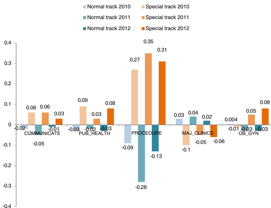
Figure 2 Composite score for each category of competency, classified by mode of admission. COMMUNICATE, communication skill; PUB_HEALTH, public health and administrative skill; PROCEDURE, procedural skill; MAJ_CLINIC, clinical knowledge in major subjects; OB_GYN, obstetric and gynecologic skill.

practice after graduation (for example, patients in university hospitals tend to present with more complicated problems, or are referred from elsewhere); they therefore commonly require specialist services, not easily handled by medical students.